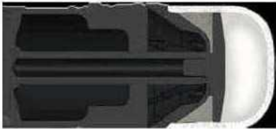
Prior to Impact