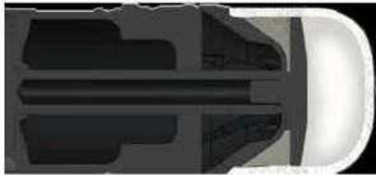
Prior to Impact